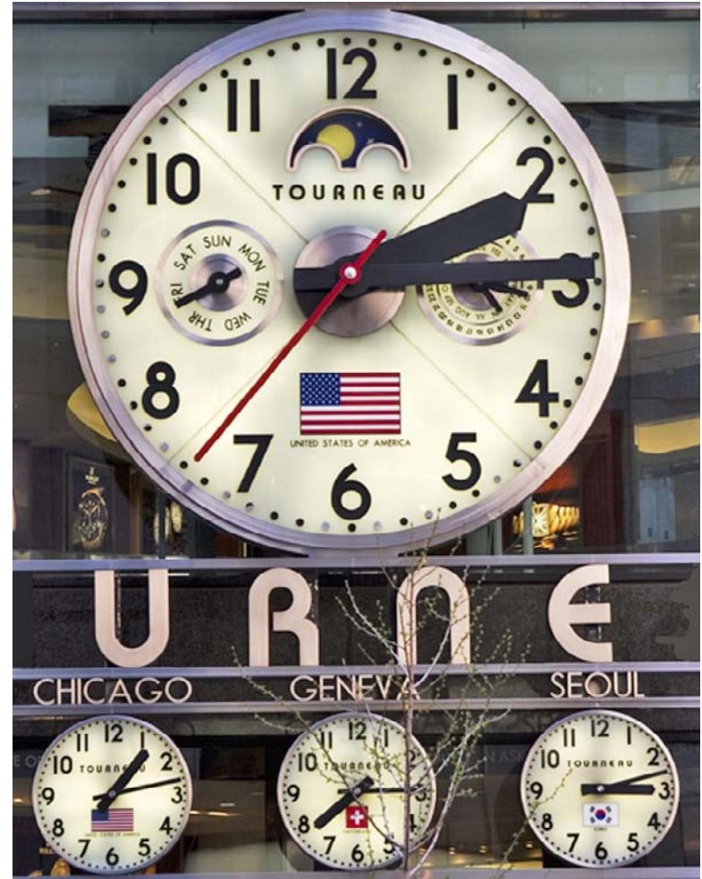
These clocks show the time in cities all over the world.