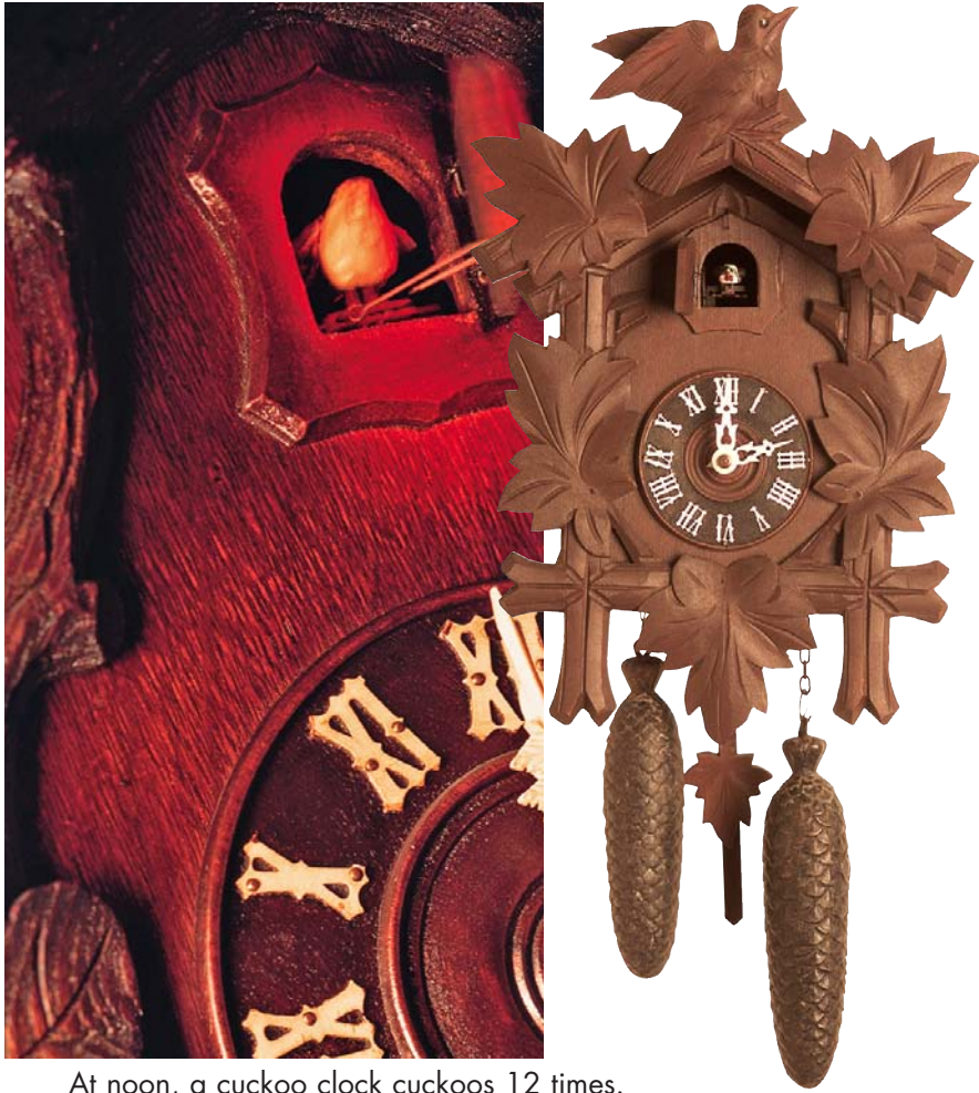
At noon, a cuckoo clock cuckoos 12 times.

Inside one kind of analog clock is a carved bird called a cuckoo . Every hour, the door opens and the bird pops out and sings its song: cuckoo, cuckoo, cuckoo!