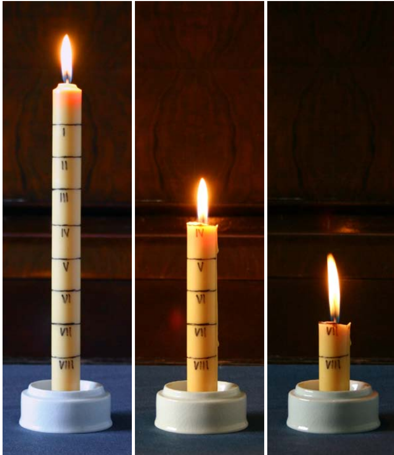
Candle clocks were used to tell time after the sun went down.

Another kind of clock that didn't need the sun was a candle clock . You would know the time by how much of the candle had melted. The candle had marks down its side to show the hours.