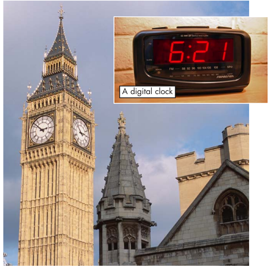
Big Ben, an analog clock tower in London, England

Now there are all kinds of timepieces, from tall grandfather clocks to watches we wear on our wrists. Most clocks run on electricity from batteries.