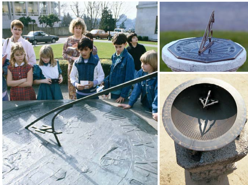
Sundials made telling time using shadows more accurate.

But shadow clocks were not good for telling time on cloudy days—or at night.